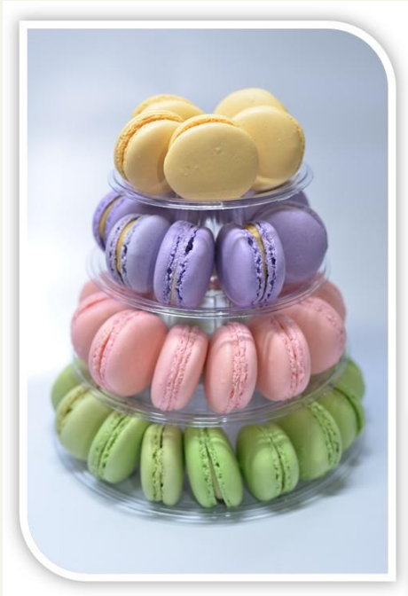
4-Tiers Macaron Tower